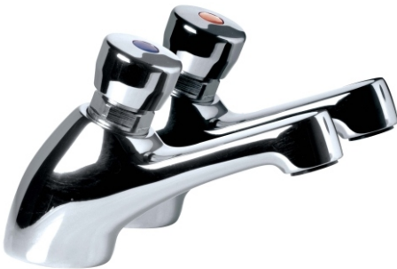
non concussive basin mounted tap (pairs) NC160CP

inta taps used as water economy device operate for a period of time and then closes automatically