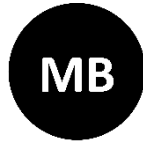
Matt black RAL 9005