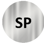
Polished Stainless Steel